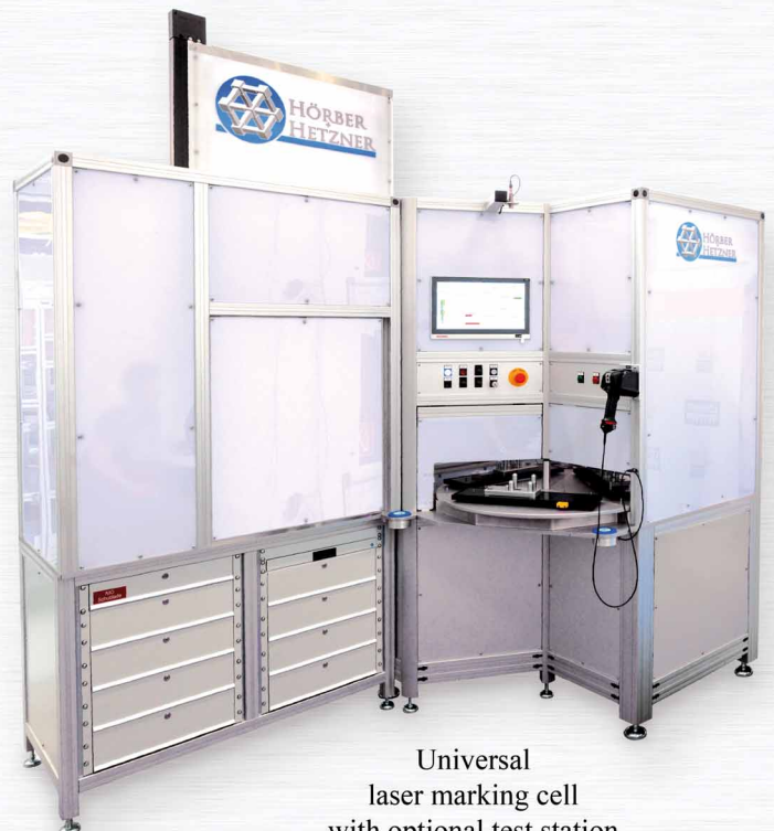
Universal laser marking cell with optional test station

True to our slogan "The Idea Factory for Mechanical Engineering", we support you in turning your project into reality.