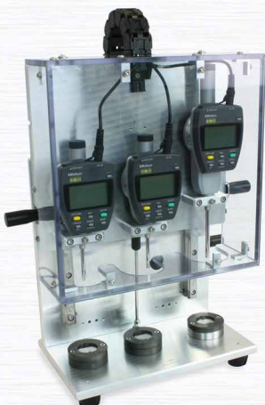
Quality measuring device for electronic components

General contractor Concept creation Configuration CAD construction Purchasing and material procurement Installation and commissioning Quality control Documentation Change service Pneumatics and function plans Spare parts procurement