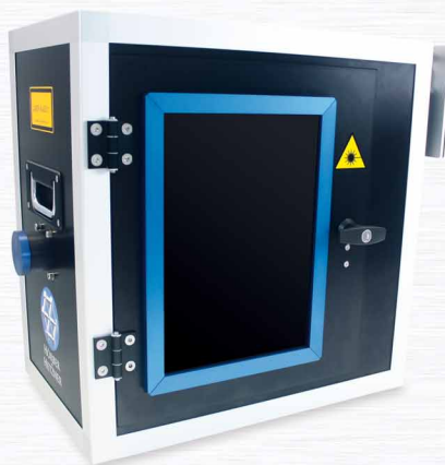
Protective box for mobile marking lasers