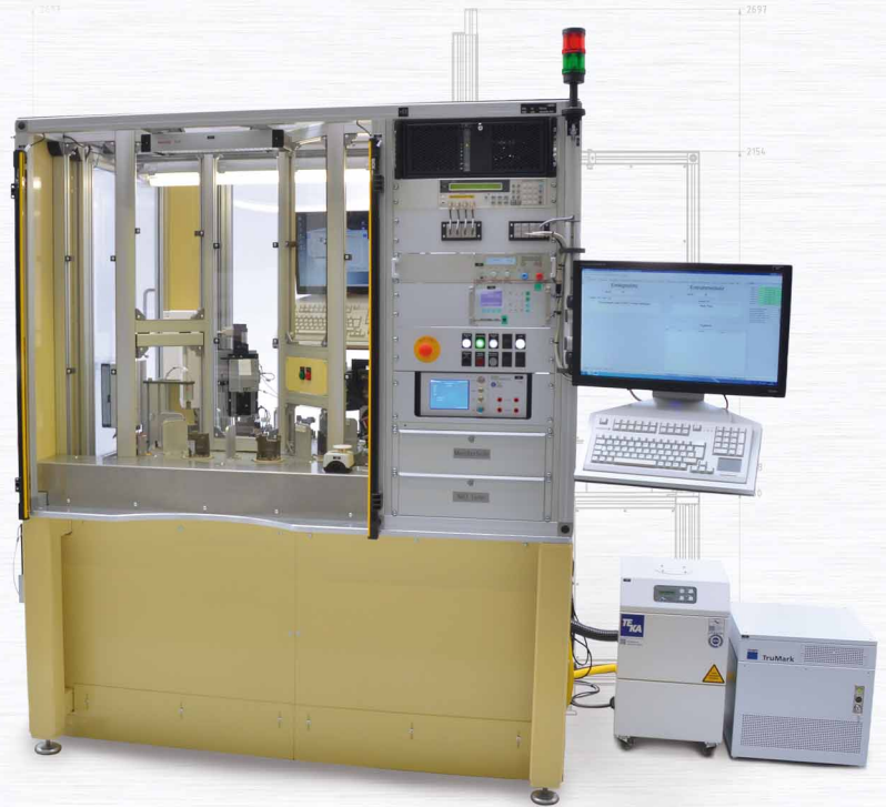
EOL programming, testing and labeling station